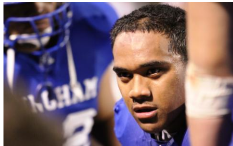
MIDDLE RIGHT: xxxxxxxxxxxx