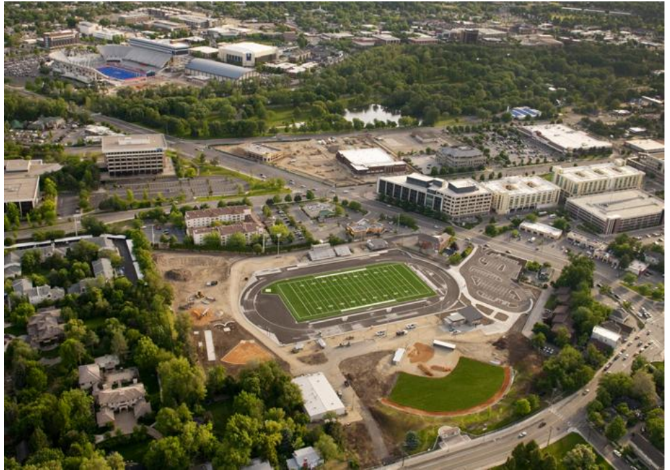
The opening of Dona Larsen Park is within sight of BSU's Bronco Stadium and quickly became a prominent attraction in Boise's East End.

"The biggest difference back in those times, that made rivalries so good, was at Bronco Stadium there would be (15,000) to 17,000 people," he said. "You'd fill the stadium and it was generally Veterans Day, they'd have huge parades and the whole community would