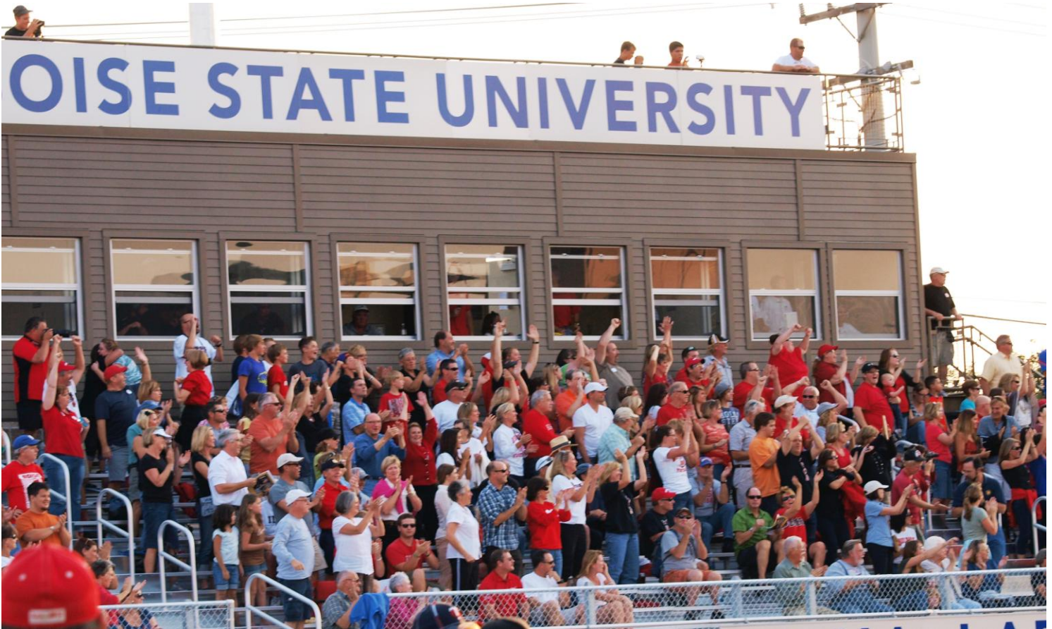
The Boise cheering section shows its support after a big play by the Braves during their game against Vallivue.